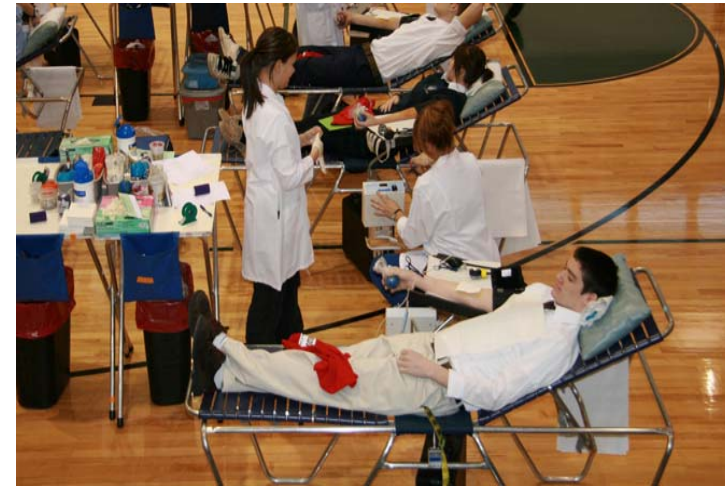
Students giving blood at the NHS Blood Drive.

The current members of the National Honor Society are truly living by the values that define the NHS. Through the blood drives and the fundraiser for Cystic Fibrosis, the NHS has